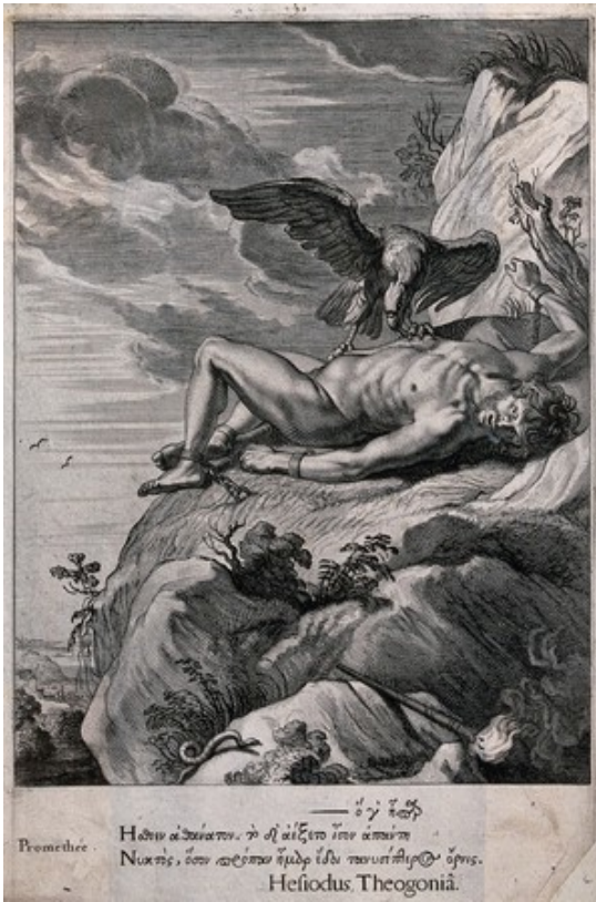
Marolles' "Tableaux du Temple des Muses" (Paris, 1655)