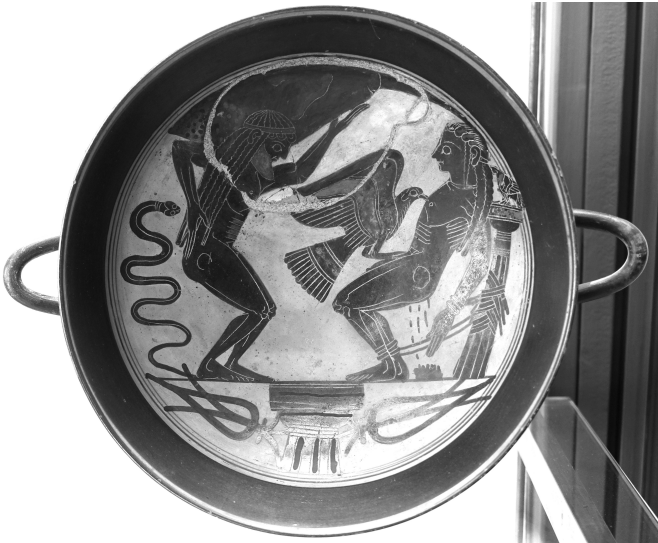
Exhibit in the Museo Gregoriano Etrusco - Vatican Museums

the changes are gradual or occur in peak moments, the energy of Uranus remains persistent, urging towards greater freedom and authenticity. Therefore, wherever Uranus is transiting the chart, it serves as a guide to finding liberation and breaking free from any feelings of stagnation or limitation. By aligning with the energy of Uranus and focusing on the themes of the transiting house, we can initiate transformative shifts in our lives.